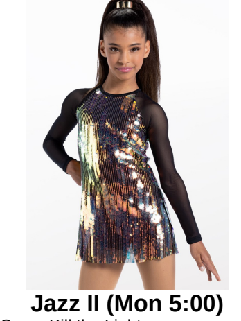
Song: Kill the Lights Career: Electrician