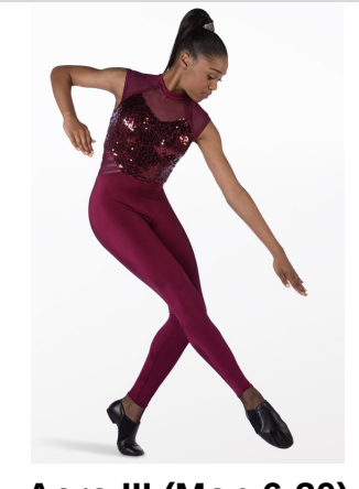
Acro III (Mon 6:30) Song: Work Song Career: General Working