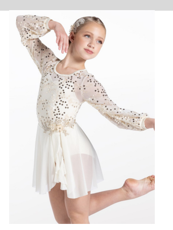
Ballet II (Tues 6:30) Song: Soldier Career: Soldier