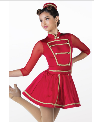
Tap II (Tues 7:30) Song: Bell Hop Boogie Career: Bell Hop