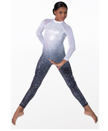
Acro II (Tues 5:30) Song: Send Me the Moon Career: Astronomer