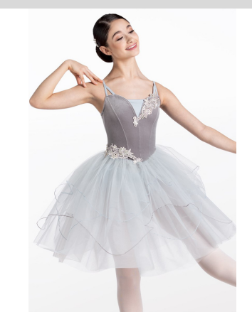
Ballet III (Mon 7:30) Song: The Scientist Career: Scientist